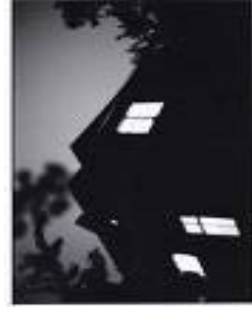
Violence in the home affects the family and the community

The Umbrella does not mandate participants to attend classes, but participants will be expected to sign a release of their information to allow verification of their attendance to referrers. Attendance